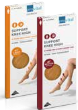
SUPPORT KNEE HIGH