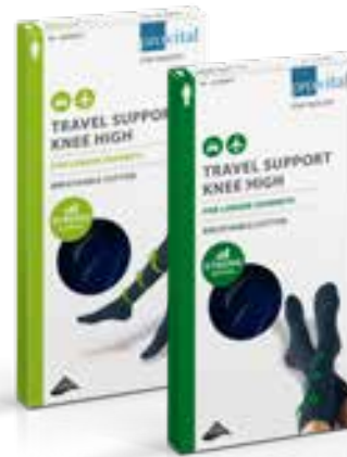
TRAVEL SUPPORT KNEE HIGH

A support knee high works as much simple as effective. The outwardly-acting, precisely defined, mechanical pressure profile working from the ankle upwards in a decreasing manner naturally causes a reduction of the venous diameter. The venous valves can close better, which means better blood circulation. During movement, the support knee high also has a resistance for the muscles, which can therefore work more effectively.